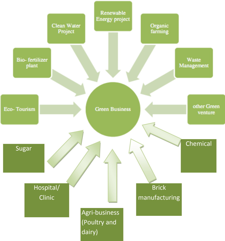
Spectrum of some green business

For financing, environment friendly business activities and energy efficient industries would be given preference by UBL.